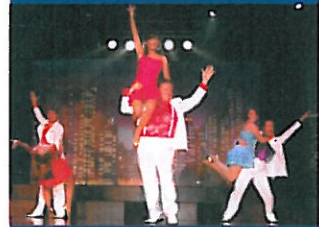
AMERICA'S HIT PARADE SHOW