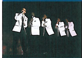
SOUL OF MOTOWN