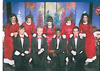
"TIS THE SEASON" SHOW