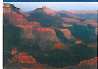
View the spectacular Grand Canyon