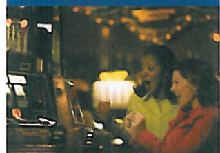
World-class Gaming and Excitement