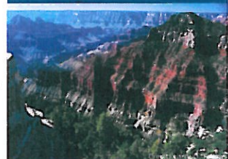
Experience the majestic scenery

Departure: Elmdale Park, 400 East Ave. E. St, Hutchinson, KS @ 8 am