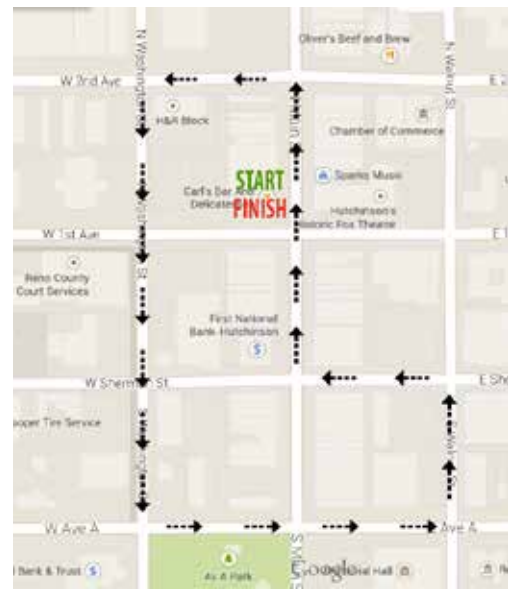
This .9-mile fast and flat course goes through Downtown Hutchinson.

Men's & Women's Races are $30 each. Field limit of 70 per race. *Men's 40/50 event at 4:20 p.m.